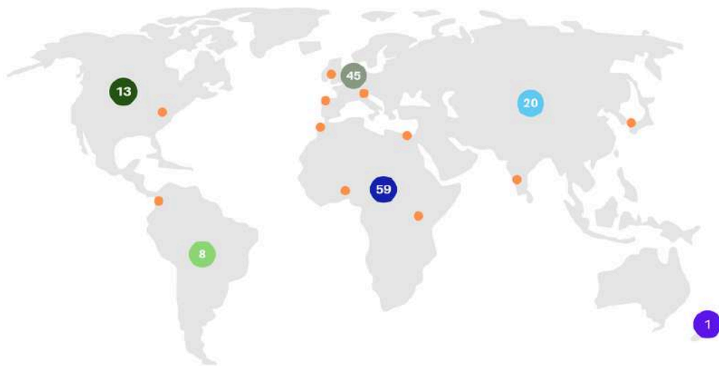
Number of member organization seats per country