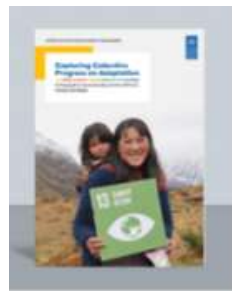
Capturing Collective Progress on Adaptation